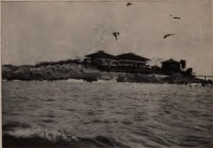
Culbra Island, Zone Quarantine Station